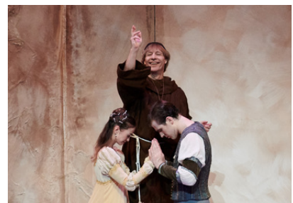
Father Lawrence, Advisor to Romeo