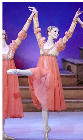
Rosaline, Juliet's Cousin, adored by Romeo