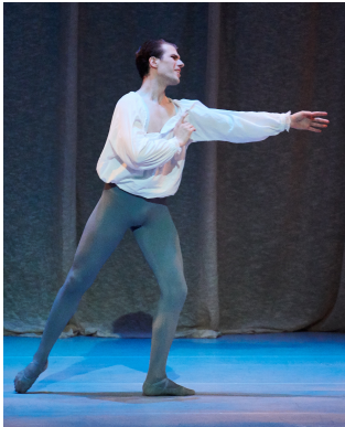
Romeo, a Montague