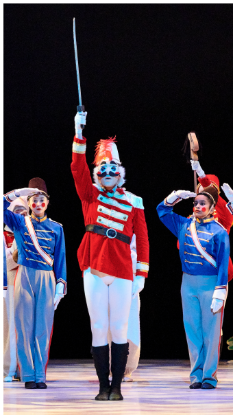
Nutcracker, as a Soldier