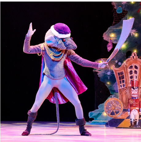
Mouse King, Foe to the Nutcracker