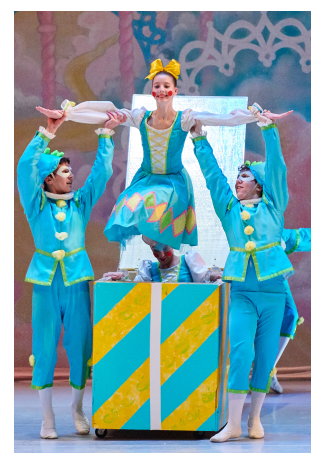
French Ribbon Candy