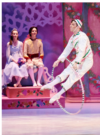
Russian Candy Canes