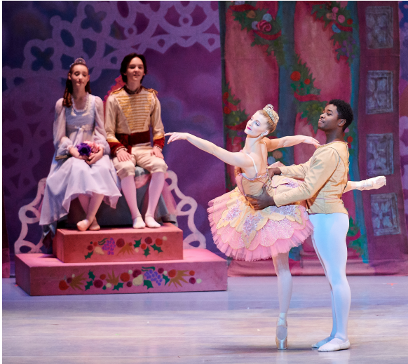
Sugarplum Fairy and her Cavalier