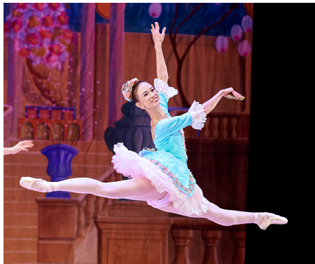
German Marzipan Cookies