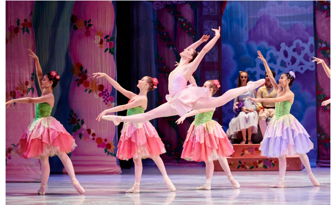
Dewdrop and her waltzing Flowers