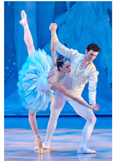
Snow Queen and King